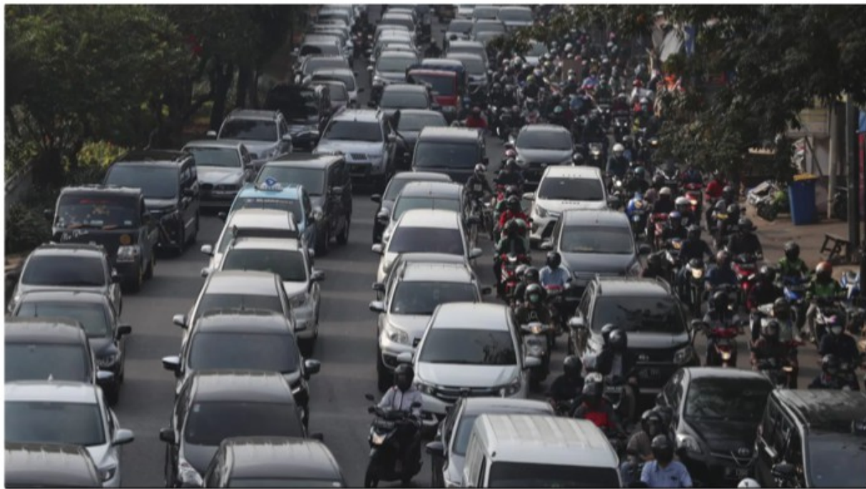
Bumper to bumper.

In the world's biggest cities, the demand to drive far outstrips the supply of roads. As a result, commuters in major metropolitan areas face massive congestion.