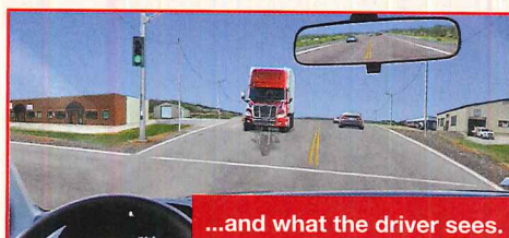
...and what the driver sees.